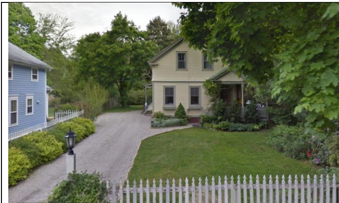
Figure 1. 48 Church Lane (the house is gray now).

Joe and Phil will be providing the burgers and dogs and a few other things.. Each 'boat' may bring an appetizer and also please bring your own drinks (BYOB). Ice and coolers and basic mixers (e.g. ginger beer) will be provided.