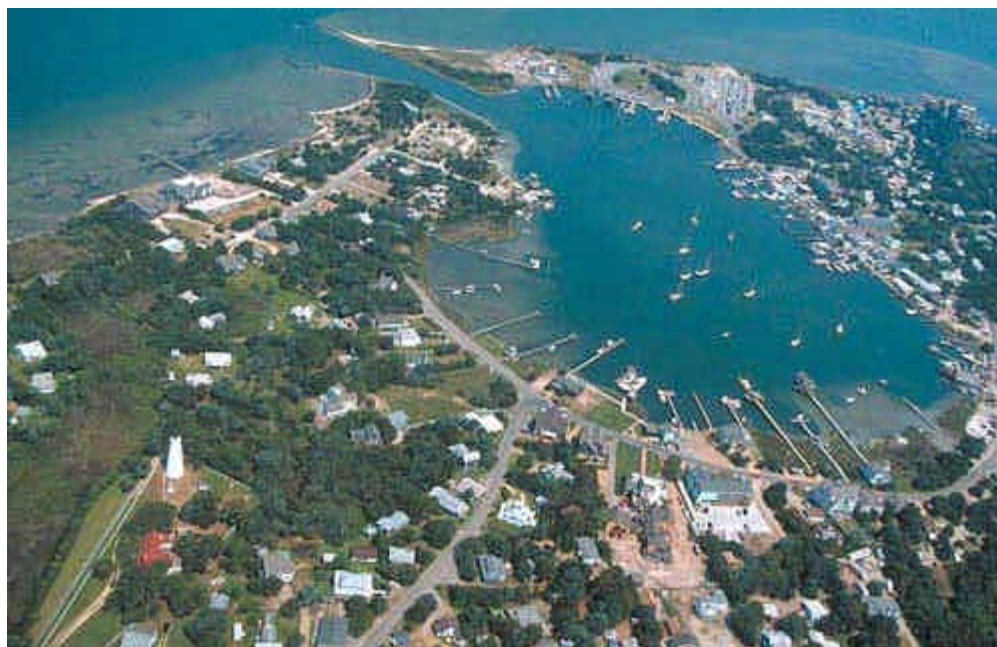
Silver Lake Harbor

http://www.ocracokeisland.com/Ocracoke.htm