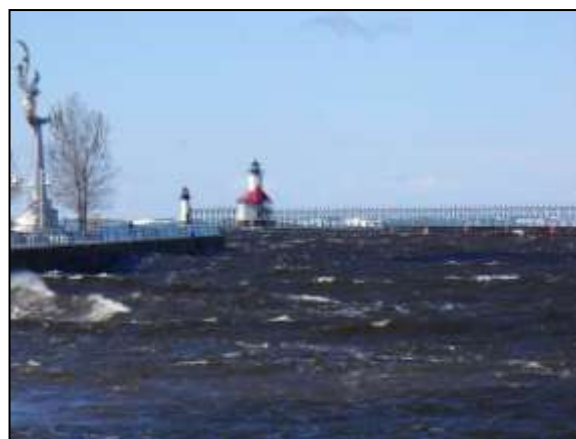
The channel during a fall storm.

Located in a brand new pavilion, the carousel comes close to recreating an old-time St. Joseph carousel that closed sometime in the 70s, I believe. And nearby Silver Beach is one of the most attractive beaches on Lake Michigan.