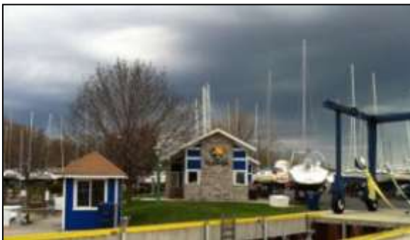
New office and haul-out well at West Basin

The St. Joseph River channel is well marked and dredged to a depth of approximately 20 ft. Visitors arriving by boat can find transient slips at either West Basin Municipal Marina or Harbor Isle , a private marina located upriver. West Basin, located on the north side of the channel, has several well-maintained transient slips, is easily accessed, and provides foot access to Tiscornia Beach. The marina is located next to the St. Joseph River Yacht Club , a beautiful, historic brick building on the water's edge, and a railroad swing bridge. The entrance is clearly marked and the marina has good depth for moderate-draft vessels. Major renovations in fall 2009 and early spring 2010 resulted in updated docks and a new marina office. Harbormaster Jimmy Carolla is very friendly and accommodating. Visitors should contact the harbormaster on VHF Ch. 9 for slip assignment. As always, specify your vessel type, length, and draft.