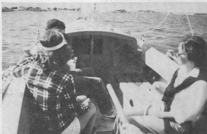
You sit in her, not on her. Solid teak seats and the high teak coamings surrounding her deep cockpit give you a feeling of comfort and security.