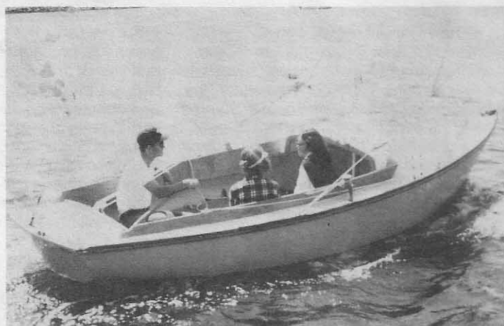
Her amazing 8 foot cockpit affords more room to stretch out and relax than most 30 footers.