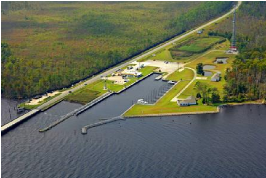
Alligator River Marina