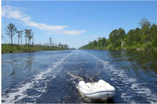
Alligator River – Pungo River Canal