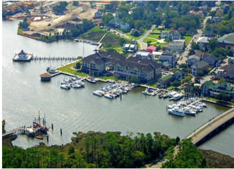
Manteo Waterfront Marina