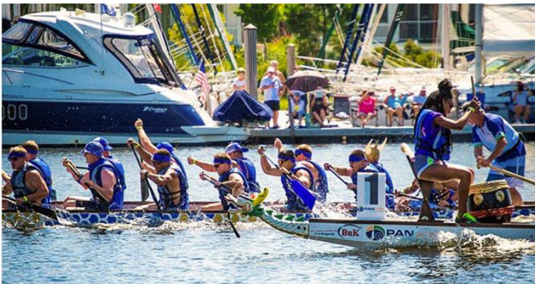
Dragon Boat Races in Grace Harbor August 11-12, 2017