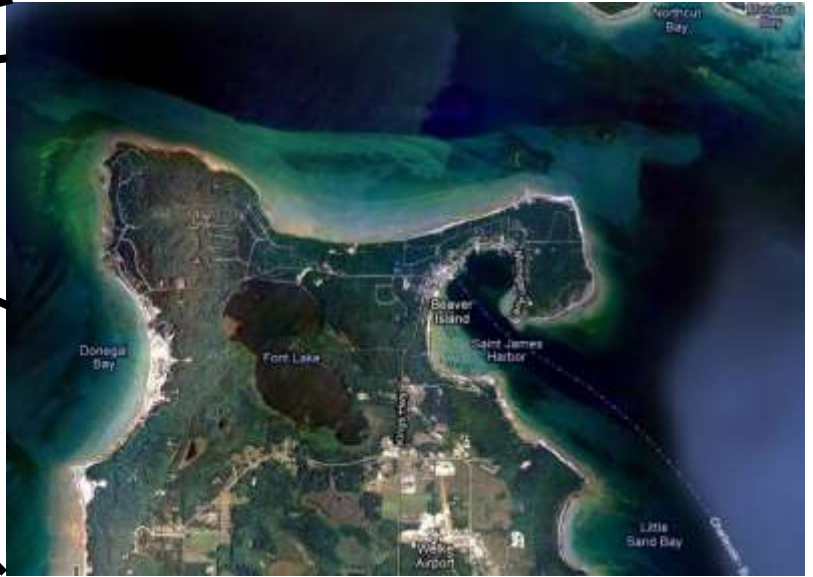
Beaver Island's St. James Harbor (right), location of GLF Rendezvous August 2 – 6.

Brochure describing Beaver Island Boat Company's 2010 Ferry Schedule between Beaver Island and Charlevoix, MI: